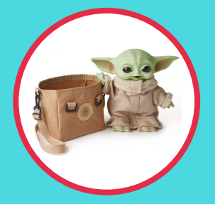
12. Star Wars™ The Mandalorian™ Tan & Green The Child 11.5" Premium Bundle