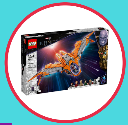
LEGO® Marvel Studios The Guardians' Ship