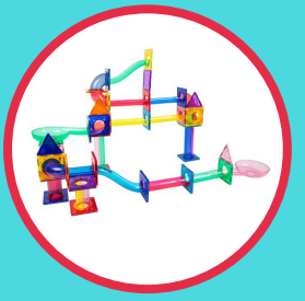
10. PicassoTiles Marble Run 71-Piece Magnetic Building Blocks