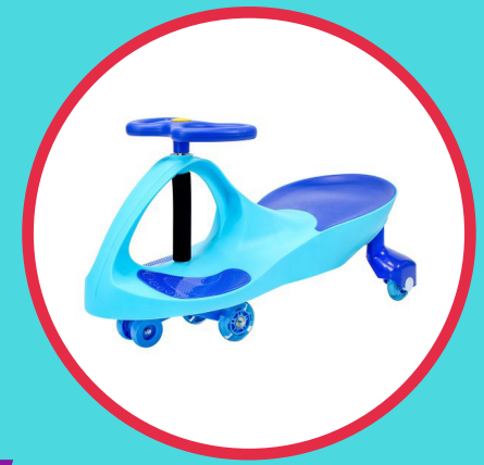
Joybay Sky Blue Premium LED Swing Car