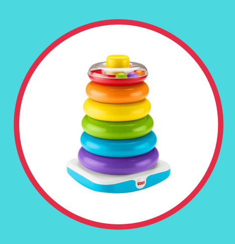
Fisher-Price® Giant Rock-a-Stack® Toy