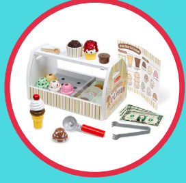
23. Melissa & Doug Scoop & Serve Ice Cream Counter Play Set