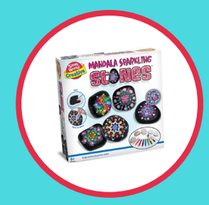
25. Small World Toys Mandala Sparkling Stones Paint Set