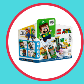
15. LEGO° Super Mario™ Adventures with Luigi