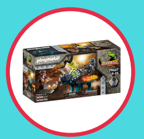
20. PLAYMOBIL Triceratops Battle for the Legendary Stones Toy Set