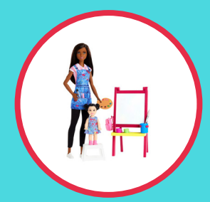
9. Barbie<sup>®</sup> Art Teacher & Student Doll