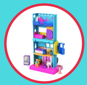
13. Polly Pocket™ Pollyville™ Hotel