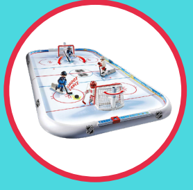
24. PLAYMOBIL NHL® Hockey Arena Set