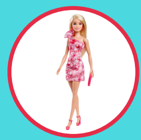
7. Barbie® Holiday Doll