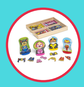
21. Melissa & Doug Paw Patrol Magnetic Pretend Play Set