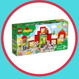
14. LEGO° DUPLO° Barn, Tractor & Farm Animal Care