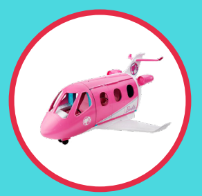
17. Barbie® Travel Dreamplane Set