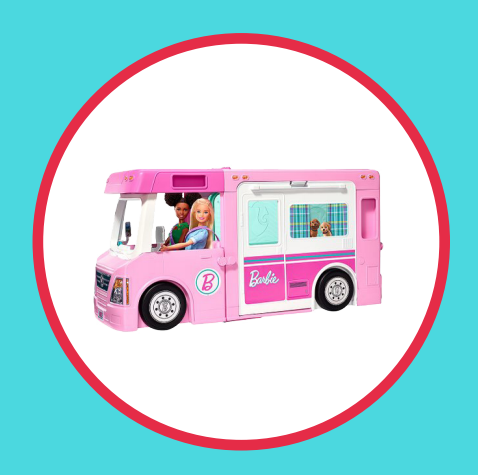
Barbie® Three-In-One Dreamcamper Set

If you're planning to buy toys for a little one in your life, 'tis the season to start shopping early. Zulily's in-house toy experts compiled a list of the 25 must-have toys of the 2021 holiday season to help moms keep their finger on the pulse of what's trending among kids and what toys they'll wish for most. Moms can find these or similar toys in Santa's Workshop on Zulily.com, which is a dedicated shopping destination for all things toys within their Holiday Shop. With Zulily's assortment changing every day, make sure to shop early, as most of its sales events last only 72 hours – so once it's gone, it's gone! But with new things added every day, customers can check back often to find exactly what they're looking for.