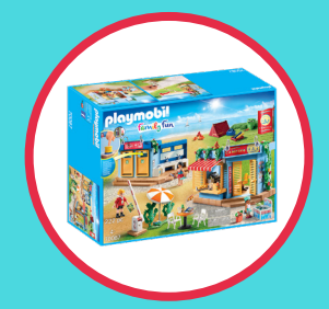
22. PLAYMOBIL Large Campground Toy Set