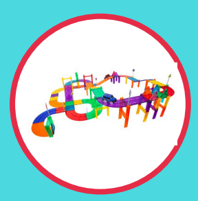
18. Picasso Tiles Race Track 81-Piece Magnetic Building Blocks