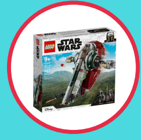
11. LEGO° Star Wars™ Boba Fett's Starship